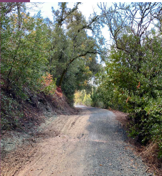
Top Left: Coal Creek Open Space Preserve (Kyle Putnum)